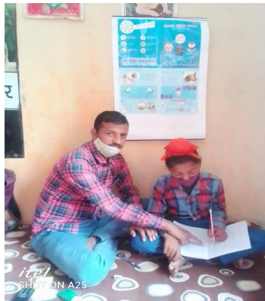
Care givers and spl. Educators attending children in homes during covid -19