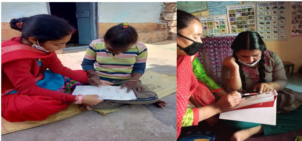
Home visits during covid pandemic by spl. Educators and care givers.

This activity was initiated in the year 2016 for those CWSN's who belong to nearby villages and can come to the educational center along with their parents _as it becomes more convenient to pay individual attention along with some kind of group activity. Our special educators are prompted to prepare their own teaching learning material. Sizes of the models are kept big for easy discrimination; readymade models are purchased for difficult models. Other writing material is given to the children for home exercises. Ten to fifteen children (age group above 10 years and above along with their parents gather at our day care and perform the following activities. Main objective of this program is to train children above ten years of age in vocational and skill attainment for their livelihood, employment, adjustment in society and to fulfill their therapeutic need. This year we have to restrict this activity.