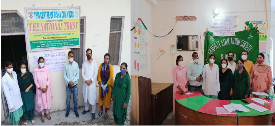
Team of Doctors and paramedical staff along with our NGO staff in our day care centre.