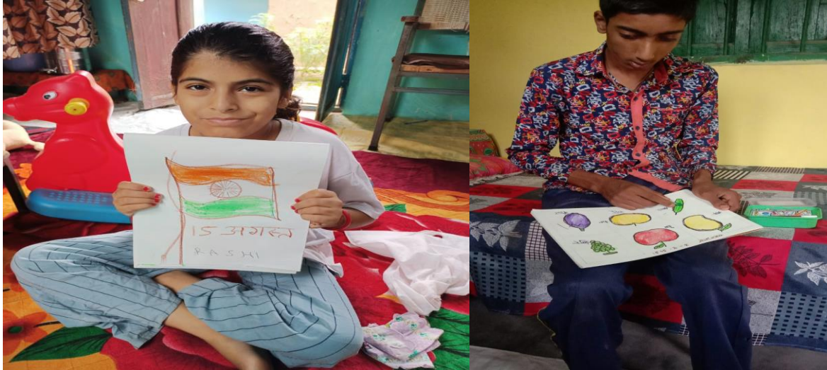
Children learning and making poster on different titles

perform their motor actions with perfection. They are helped in hand functioning, physical, occupational, speech and language therapies, medical intervention, assistive technology and early education.