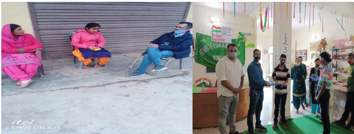
Parents counseling in home during covid -19 pandemic & in centre

It is extremely important that we organize one parents meeting once a month wherein all the problems are discussed and solutions found. Sometimes it so happens that the problem is inter-related and so is the answer. These meetings reduce the stress /depression felt by the parents/staff in the process of bringing up these children. Parents also reveal their success stories resulting out of these counseling and these discussions act as a feed back to us which gives us the next step to be organized for the particular child in conversation. In 2020-21 a total of _06_ meetings took place. in this year most of the counseling done through virtual mode due to covid -19 pandemic.