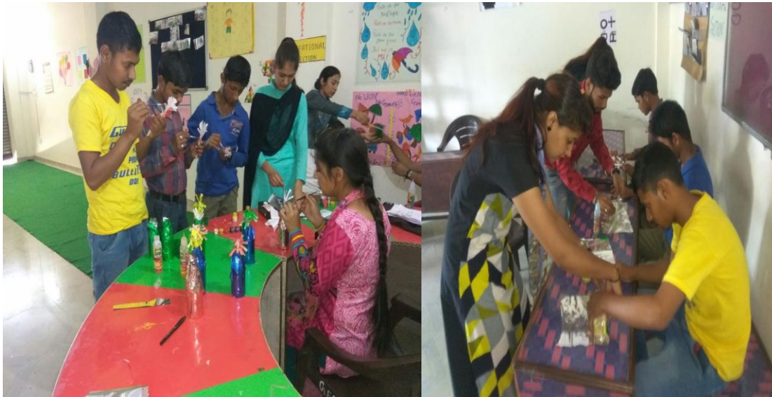
Vocational activities in day care centre

the Delhi Haat for our artifacts to be displayed. Each child goes through a similar procedure or identifying his/her interest to choose a vocation and believe us this process takes a really long time, but after we finally select a vocation to a certain child we stick to improving it in a very slow manner so that the process is thoroughly understood by the beneficiary and he /she makes it his/her ultimate habit. Some of our friends have now converted these vocational educations into small professions.